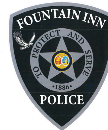
City of Fountain Inn Police Department