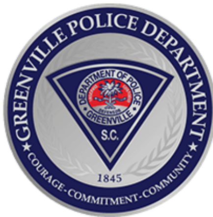
City of Greenville Police Department