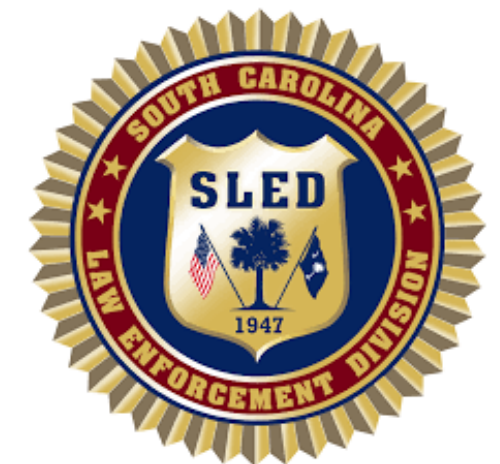
SLED Law Enforcement