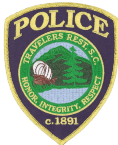
City of Travelers Rest Police Department