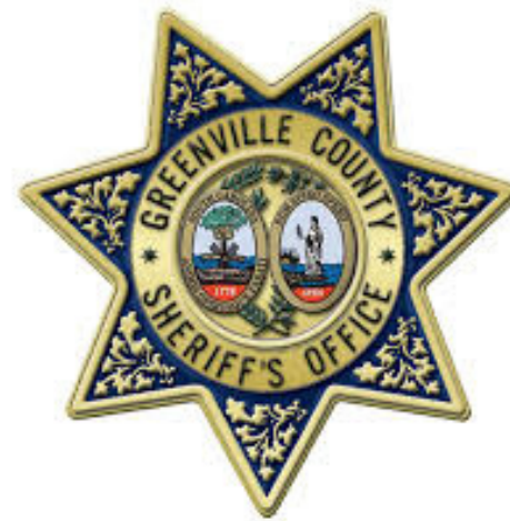
Greenville County Sheriff's Department