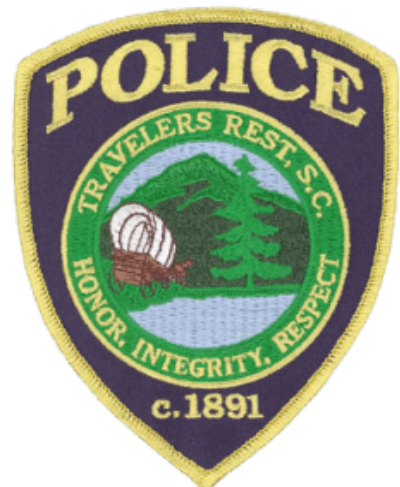
City of Travelers Rest Police Department