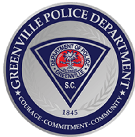
City of Greenville Police Department