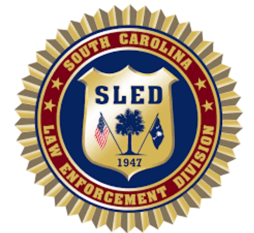
SLED Law Enforcement