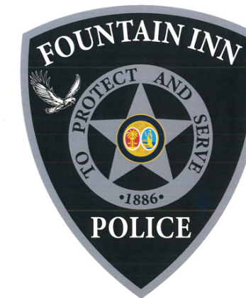
City of Fountain Inn Police Department