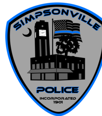
City of Simpsonville Police Department