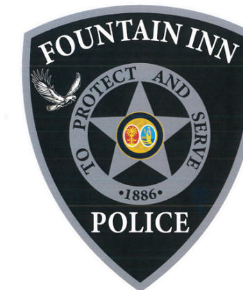
City of Fountain Inn Police Department